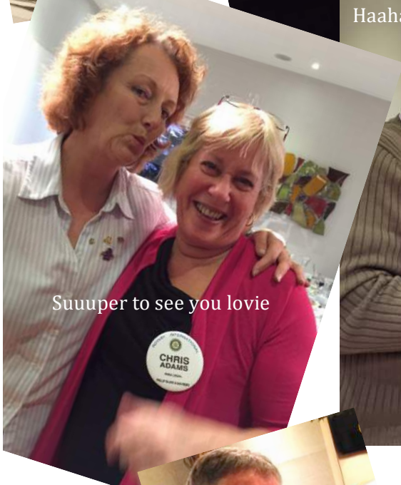
Suuuper to see you lovie