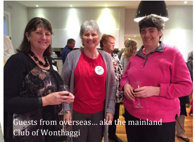
Guests from overseas... aka the mainland Club of Wonthaggi