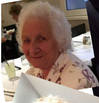
Haahahaa, if only you knew