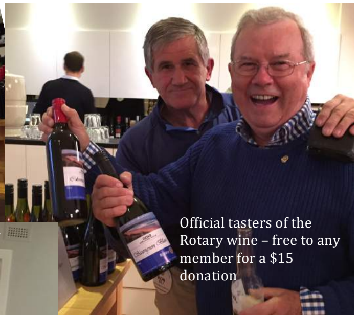
Official tasters of the Rotary wine – free to any member for a $15 donation