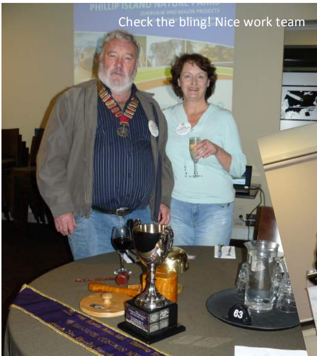
Check the bling! Nice work team