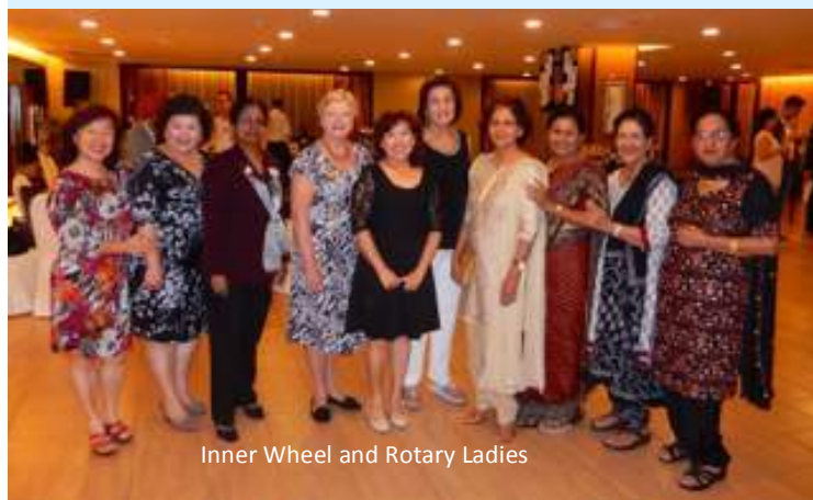
Inner Wheel and Rotary Ladies