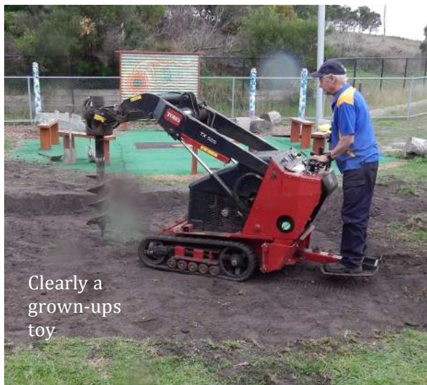
Clearly a grown-ups toy