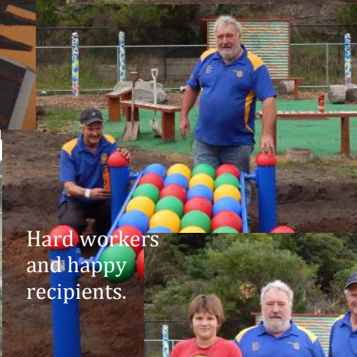
Hard workers and happy recipients.